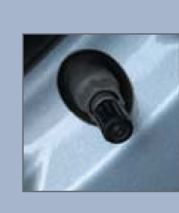
Each tire valve stem contains a TPMS sensor.