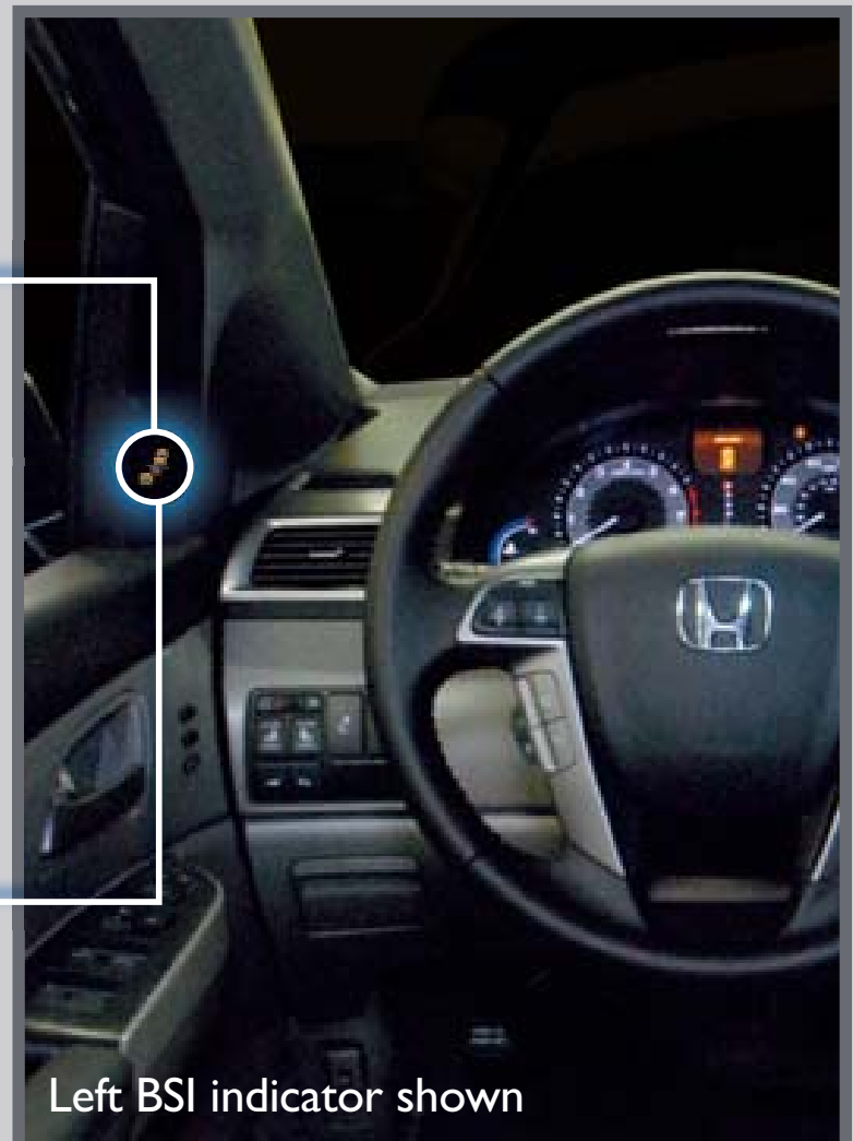
Left BSI indicator shown