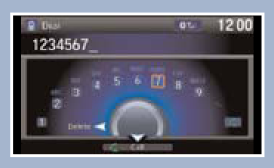
*This feature is inoperable when the vehicle is moving.

4. From the navigation screen or the touchscreen, enter the phone number. Select the green Dial icon to call.