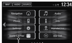
Apple CarPlay™ Icon